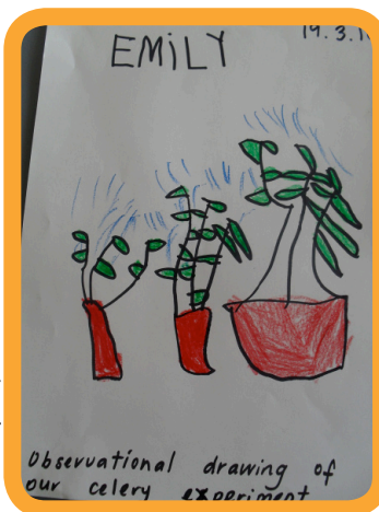
Above: Celery experiment Below: Observational drawing